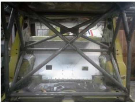
Roll Cage in our own 180B

Providing all services from maintenance to complete builds of new motorsport vehicles, specialising in custom fabrication.