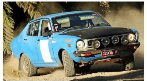
Chris's own Datsun 120y