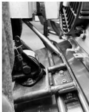
Custom tube front support bar setup