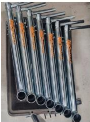
Adjustable Sill Stands designed and manufactured in-house at Pro Rally Motorsport