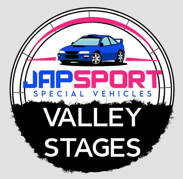
2022 Supplementary Regulations